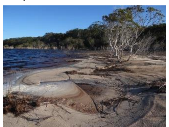
The receding waters of Lake Boomanjin created stunning patterns close to the water's edge

Su's teams worked on continuing to remove clivea lilies, cocos palms in the area just north of the pub and replaced them with Picabeen palms and a pandanus.