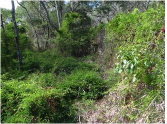
The aggressiveness and spread of the Abrus is clearly evident. What was surprising was how far it has travelled outside Happy Valley village.