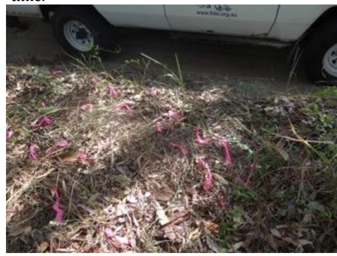
Each ribbon marks at least one Abrus root. They were thick and difficult to remove

1. Spraying. Greg continued to work withj Roundup along the fence line. The weather was perfect for spraying, little wind, hot and dry. The conundrum was though whether Roundup is the best chemical to apply. Before the next session much research will be done on spraying and sprays and we should see some results in March to help us develop a more coherent Abrus Strategy based on the results observed in a month's time.