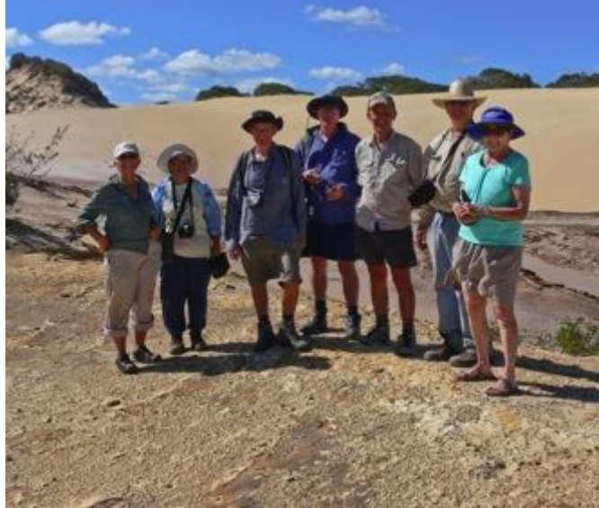
Mars' group photo in Kirrar Sandblow Hours Worked:

At 2.00 pm with all of the equipment left behind in the shed at Happy Valley we headed back south. We stopped briefly for a while at Kirrar sandblow to explore it with its many fascinating features created by laterite, fulgarite, wind and rain. It was an enjoyable interlude on our way back to Eurong where cold beer and a swimming pool awaited.