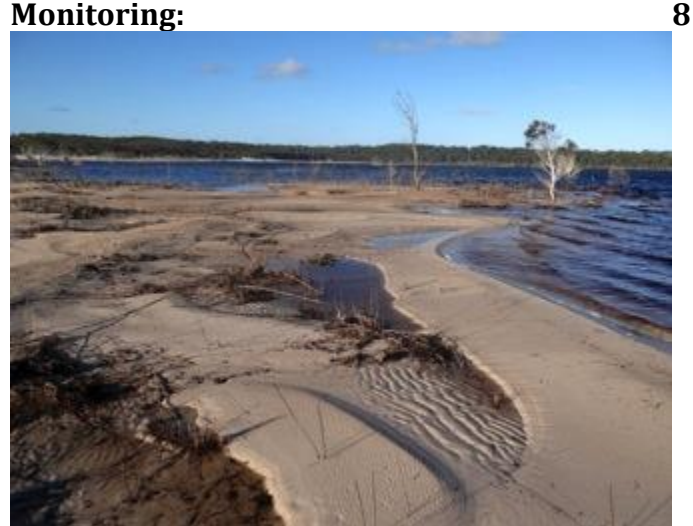
The very photogenic shores of Lake Boomanjin