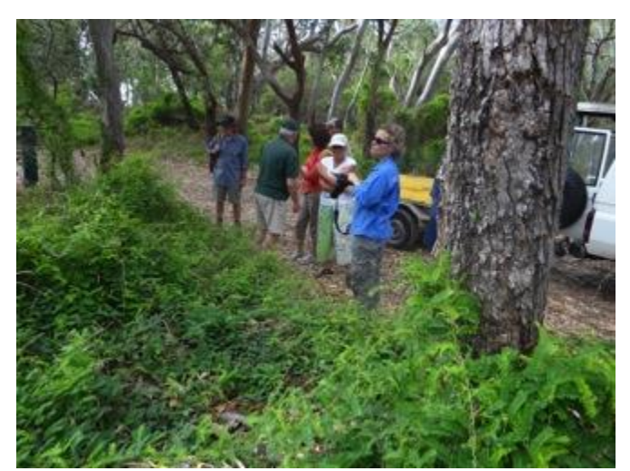
A brief stopover in Happy Valley on the way to Lake Allom revealed what a daunting task awaited us when we returned later in the week.